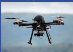
UAV / RPA / DRONE