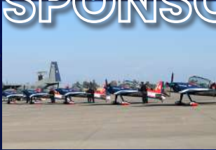
CHILEAN AIR FORCE'S EXHIBITION TEAM