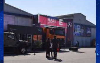
HALL TOP SIDE