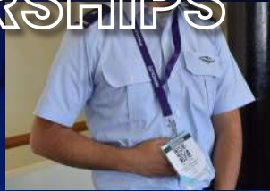
LANYARDS & BADGES