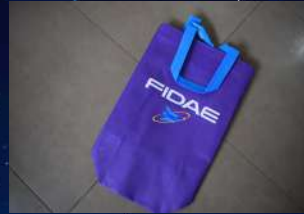
BAGS FOR EXHIBITORS