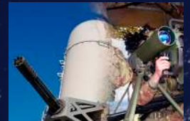
WEAPONS, ARMAMENTS & COMBAT CONTROL SYSTEMS