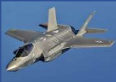
MILITARY AVIATION & DEFENSE TECHNOLOGY