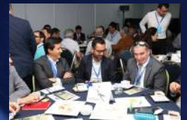
ORGANIZATIONS, FAIRS AND ASSOCIATIONS

For additional product information, contact your area executive