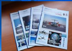
FIDAE NEWS DAILY