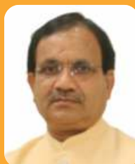
Shri Bhagwanth Khuba

Hon'ble Union Minister of Health & Family Welfare Chemicals & Fertilizers Government of India