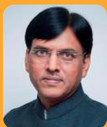
Dr Mansukh Mandaviya

Hon'ble Union Minister of Health & Family Welfare Chemicals & Fertilizers Government of India