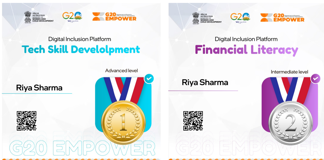
Sample Personalized downloadable 'Digital Badges'

On completion of the course of choice, the participants will receive a personalized badge/ e-certificate that can be shared on social media. The badges will have the logos of all the partners and the name of the participant.