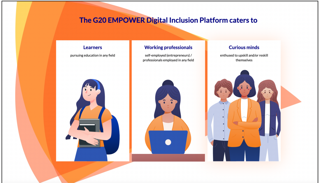
Snapshot of sample personas

Now you may click on the 'Choose a Persona' button to select a persona that best explains your current profession/ working status.